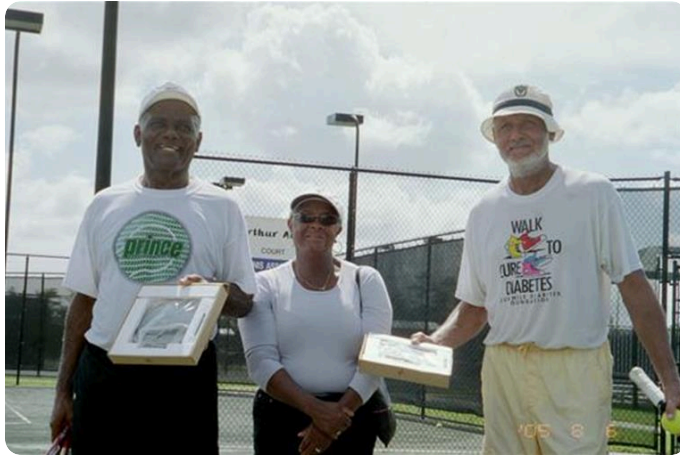
2005 ATA 65 Singles Finals