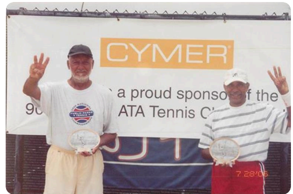
2006 ATA 65 Three Times 65 Doubles Champions- San Diego