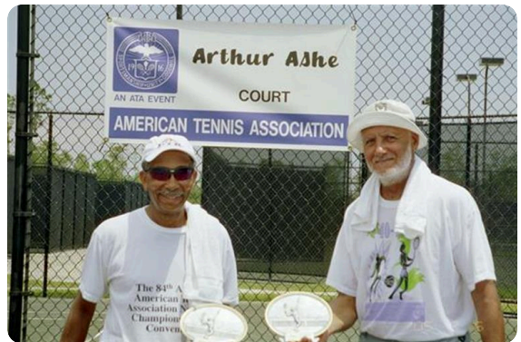
2005 ATA 65 Doubles Champions