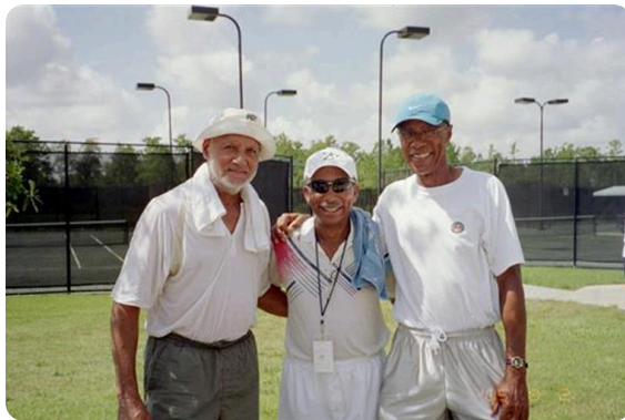
2005 ATA Nationals