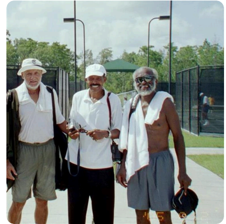
2005 ATA Nationals