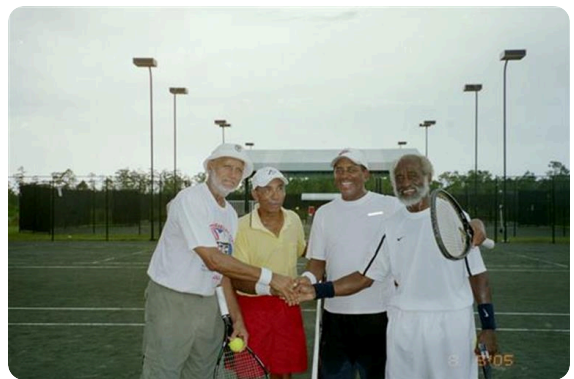
2005 ATA 65 Doubles Semifinals