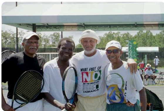
2005 ATA 65 Doubles Quarterfinals